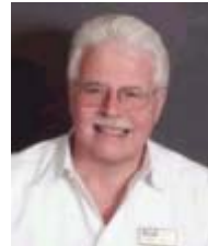
American Legion Post 137 Veterans of Foreign Wars Fleet Reserve Assoc.